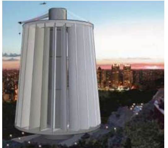
Fig .no. 1

Electricity can be generated in many ways. In each case, a fuel is used to turn a turbine, which drives a generator, which feeds the grid. The turbines are designed to suit the particular fuel characteristics. Wind generated electricity is no different: The wind is the fuel, which drives the turbine, which generates electricity. But unlike fossil fuels it is free and clean.